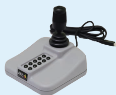
AXIS 295 Video Surveillance Joystick